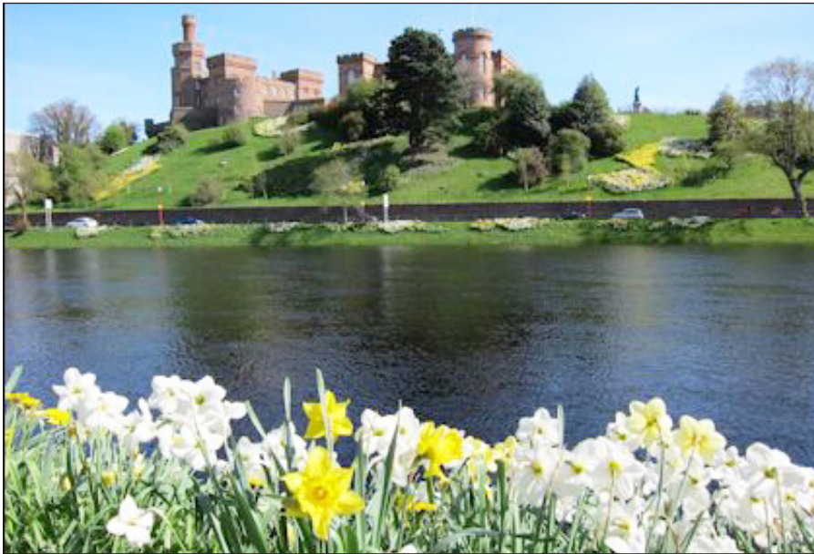
Looking across the River Ness to Inverness Castle in March

March 28, 2026, 7:30 p.m. ( note untypical starting time )